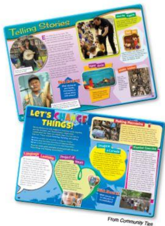
From Community Ties

Additional Teaching Supports will also be available on the Take Action for Reconciliation website, including assessment and links to recommended resources (websites, maps, books, videos)